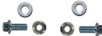
2XWasher (6), 2XBolt (M6X16), 2X Nut (M6)